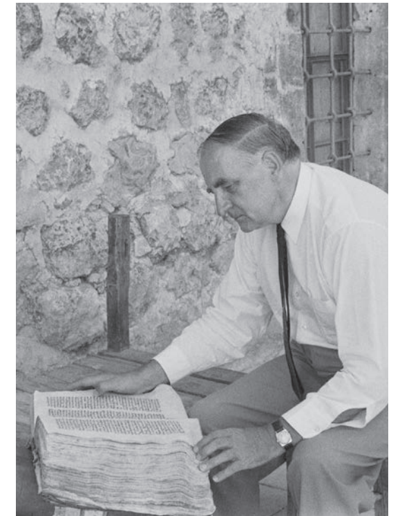
ABOVE: Dr. Arthur Vöobus (pictured) used a standard 35mm film camera to photograph Syriac manuscripts in the Middle East during the third quarter of the 20th century. His collection of film—the Vöobus Syriac Manuscript Collection—was digitized by HMML's Digital Collections & Imaging department and made available online through a website created by HMML's Systems department. (Vöobus, Photographs, PHO_MARD_Page_08_002)

We create and support a suite of technology systems that enable HMML to provide access to our collections.