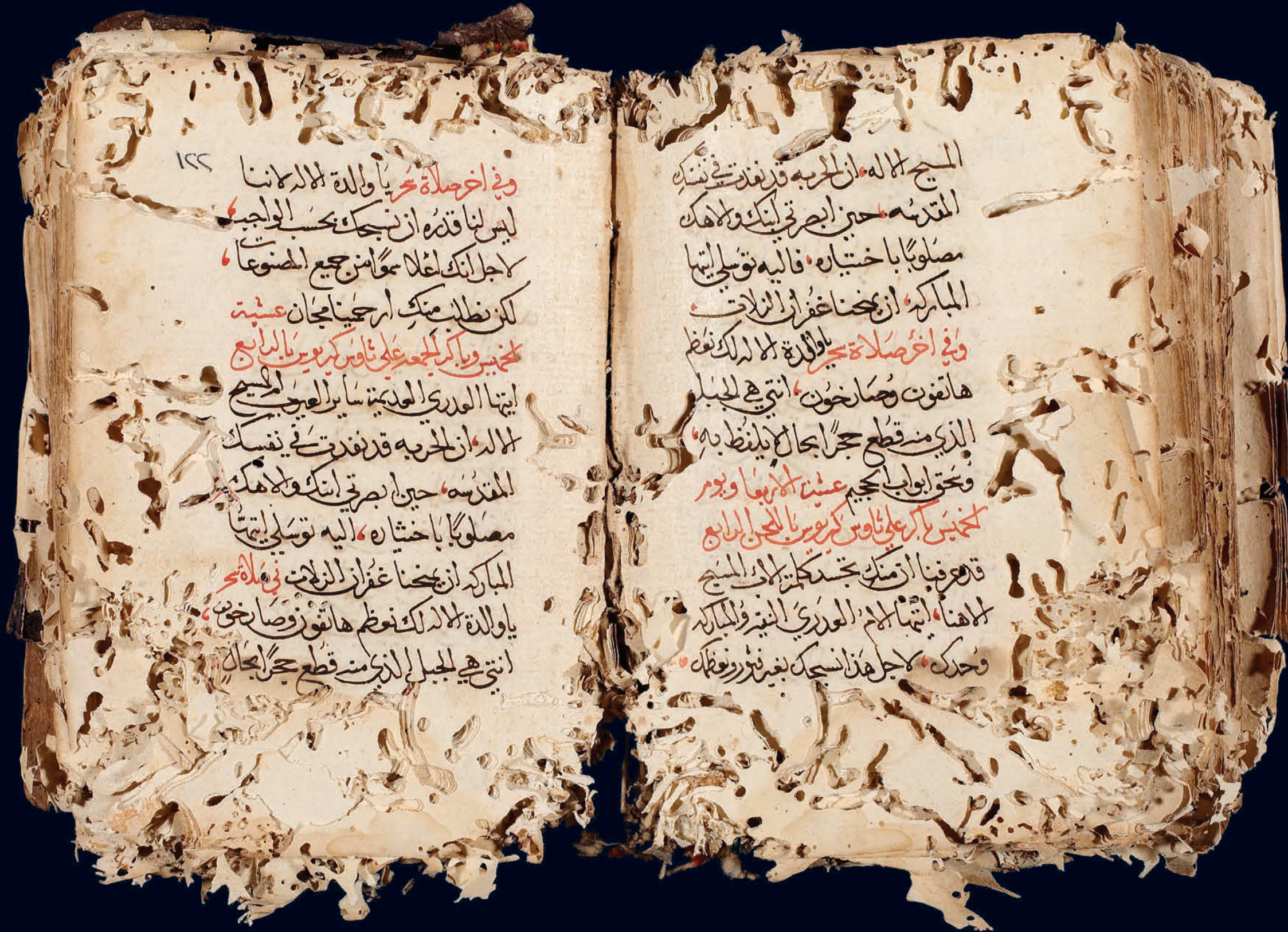
ABOVE: Worm-eaten pages of a Horologion (Book of Hours, Byzantine Rite) copied in the 17th century by the scribe Yūsuf ibn ‘Abd Allāh al-Ra’īs. This manuscript (BALA 00020) is in the collection of Dayr Sayyidat al-Balamand Monastery in Tripoli, Lebanon, and was part of HMML’s first project using digital photography, in 2003. The collection is fully digitized, cataloged, and available in HMML Reading Room ( vhmml.org ).