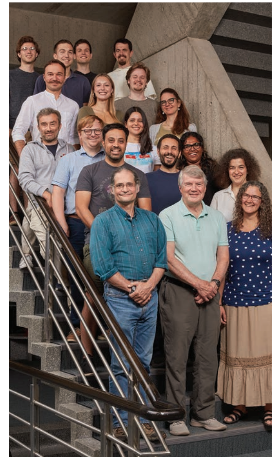
ABOVE: Members of the 2023 Dumbarton Oaks/HMML Summer School, Intermediate Syriac class, pose for a group picture during the last days of the month-long course.

We help make HMML's collections and preservation work meaningful to both a general audience and the scholarly community.