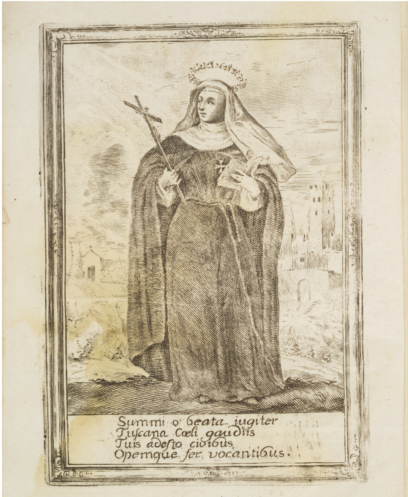
ABOVE: Engraved frontispiece of Saint Toscana for the Vita di Santa Toscana (1785) by Luigi Novarini, in the Malta Study Center Collection at HMML. (HMML 00721)