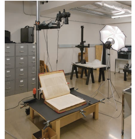
ABOVE: Oversized materials require special digitization setups. Here, a large, printed volume is photographed in HMML's studio in Collegeville, Minnesota

We collect, organize, and safeguard the digital data produced by HMML and our preservation partners.