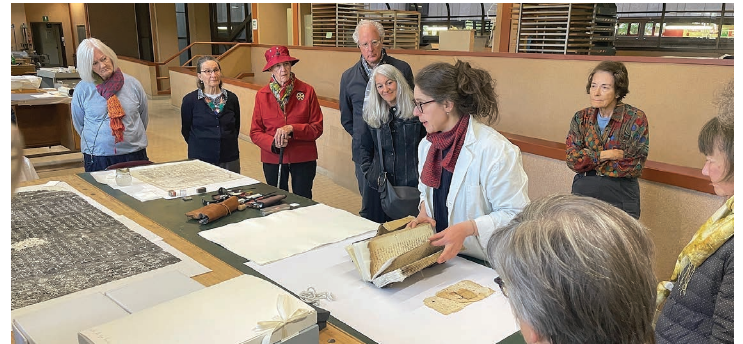
ABOVE: Visiting the State Archives of Florence, Italy, as part of HMML Journeys to Malta and Italy, April 2024.

HMML's mission continues to be promoted through owned media, including e-newsletters, well-received issues of HMML Magazine , and the popular HMML.org editorial series that highlights the breadth of HMML's collections. Social media engagement increased, and HMML moved from Twitter (which became "X") to a new social media platform, Bluesky.