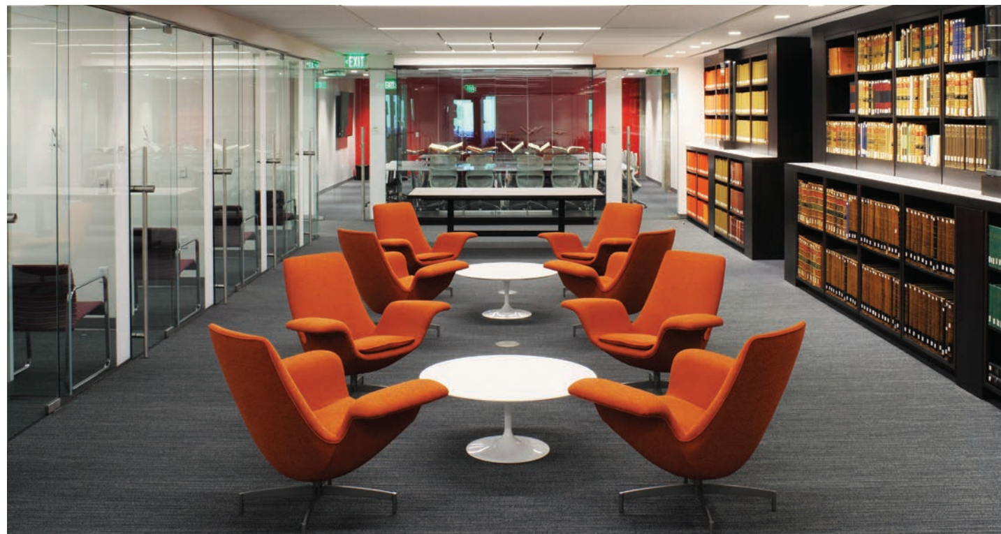
ABOVE: Fellows and visiting scholars are assigned a private study (glass offices, left) during their time at HMML and given access to the full suite of HMML's on-site and digital resources.